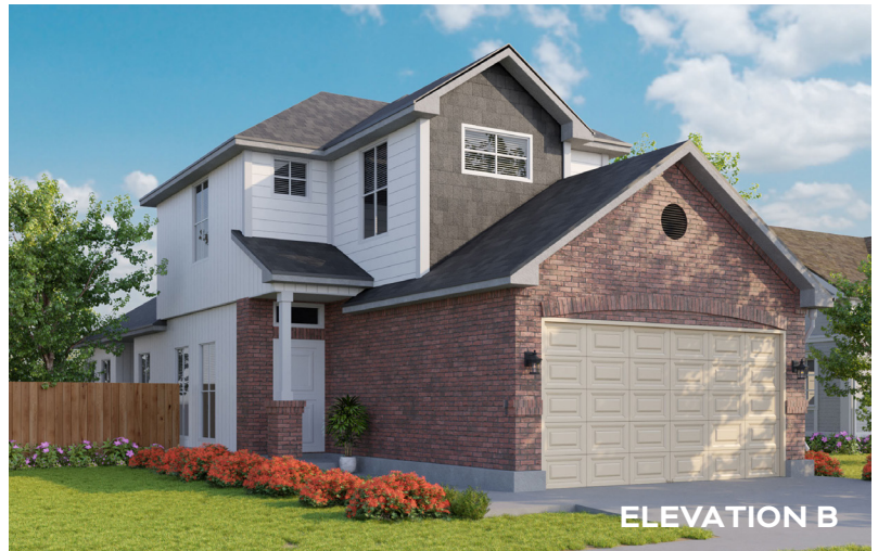
Exterior paint & finishes are representative. Floorplan colors do not indicate flooring type.